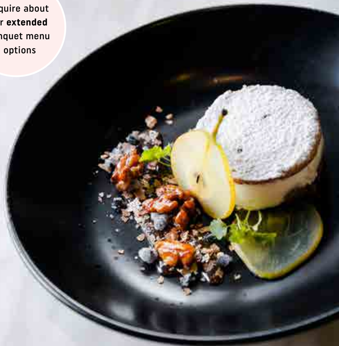
Sicilian Lemon Cheesecake

WARNING It is the client's responsibility to notify Doltone House of any attendees who may suffer from food intolerances or allergies including but not limited to traces of nuts. Doltone House cannot guarantee menu items unless notification of specific requirements are provided in writing PRIOR to your event.